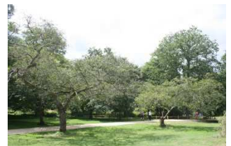
Bushy Park. These pictures were taken before the walk!